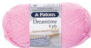
Dreamtime Merino 4 ply 100% Merino Wool

Assistline (Melbourne, Australia.) +61 3 9380 3888